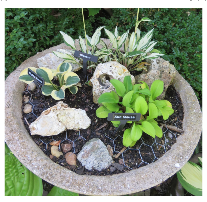
H. 'Mighty Mouse', 'Hideout', 'Sun Mouse'

The first little hostas I bought were 'Ginko Craig' and 'Chartreuse Wiggles', which is still one of my favorites. I planted them among my other hostas and thought they looked pretty there. But there were two problems: 1) The slugs and snails had too easy access to them on the ground. 2) The other, larger plants quickly overwhelmed them. So, it is best to dedicate a special place in your garden for the little ones (maybe a raised bed) or grow them in pots. This picture shows a blue bowl containing 'Chartreuse Wiggles' and 'Giantland Mouse Cheese'.