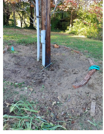
Cleared flower bed

The flower bed looks great, for now. The rest of the five acres still has dense areas of Chinese privet, bush honeysuckle, and blackberries. I don't mind pruning and weeding the blackberries since I profit $300 every summer selling them. The rest should continue to keep me busy during this wonderful cool weather.