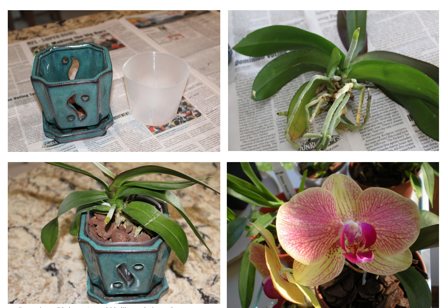
Repotting a Phalaenopsis; : orchids like to drain, so I use pots with liners. And a happy Phalaenopsis orchid.

Repot every year or so, in fir bark or sphagnum moss, after the plant finishes blooming. Orchids are not repotted to give them more room, but to change the potting mix. Water to soften the mix first. Work old medium loose, then clip dead roots. Give the plant less light until it has had a chance to adjust to its new mix.