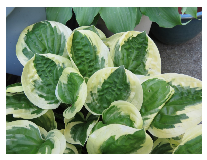
H. 'Fruit Loop'

Two little hostas that just barely missed being classified as minis but are nevertheless very small are H. 'Fruit Loop' and 'Lakeside Dimpled Darling'. These are two of my favorite hostas because they have absolutely marvelous foliage.