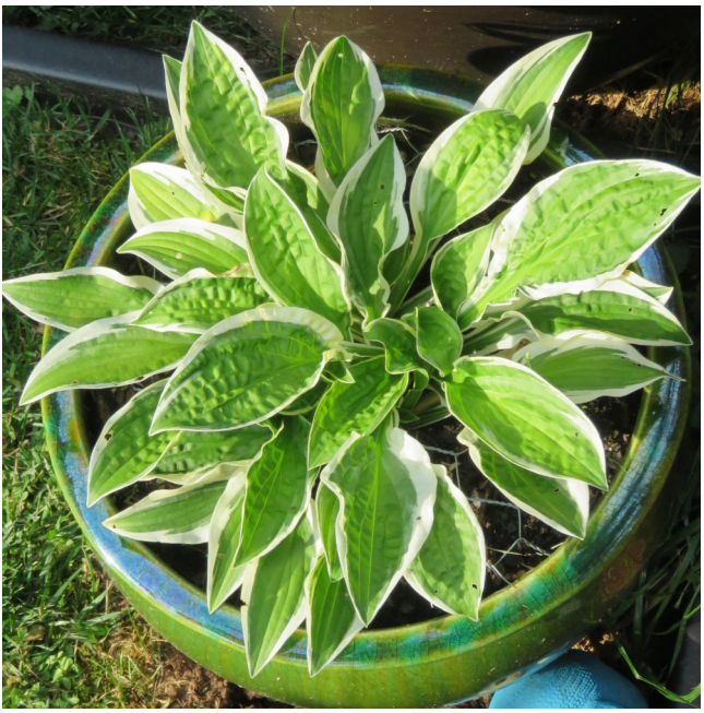
H. 'Lakeside Dimpled Darling'

Two little hostas that just barely missed being classified as minis but are nevertheless very small are H. 'Fruit Loop' and 'Lakeside Dimpled Darling'. These are two of my favorite hostas because they have absolutely marvelous foliage.