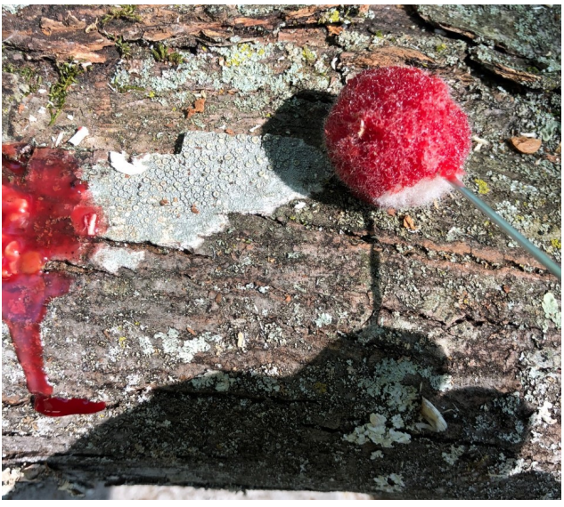
Apply the melted wax over the plugs with a wool dabber.

Drill holes and insert the plugs, they should fit tight. Then tap into the hole. The top of the plug should be flush with the hole. Holes are spaced in a diamond shape about five-six inches apart.