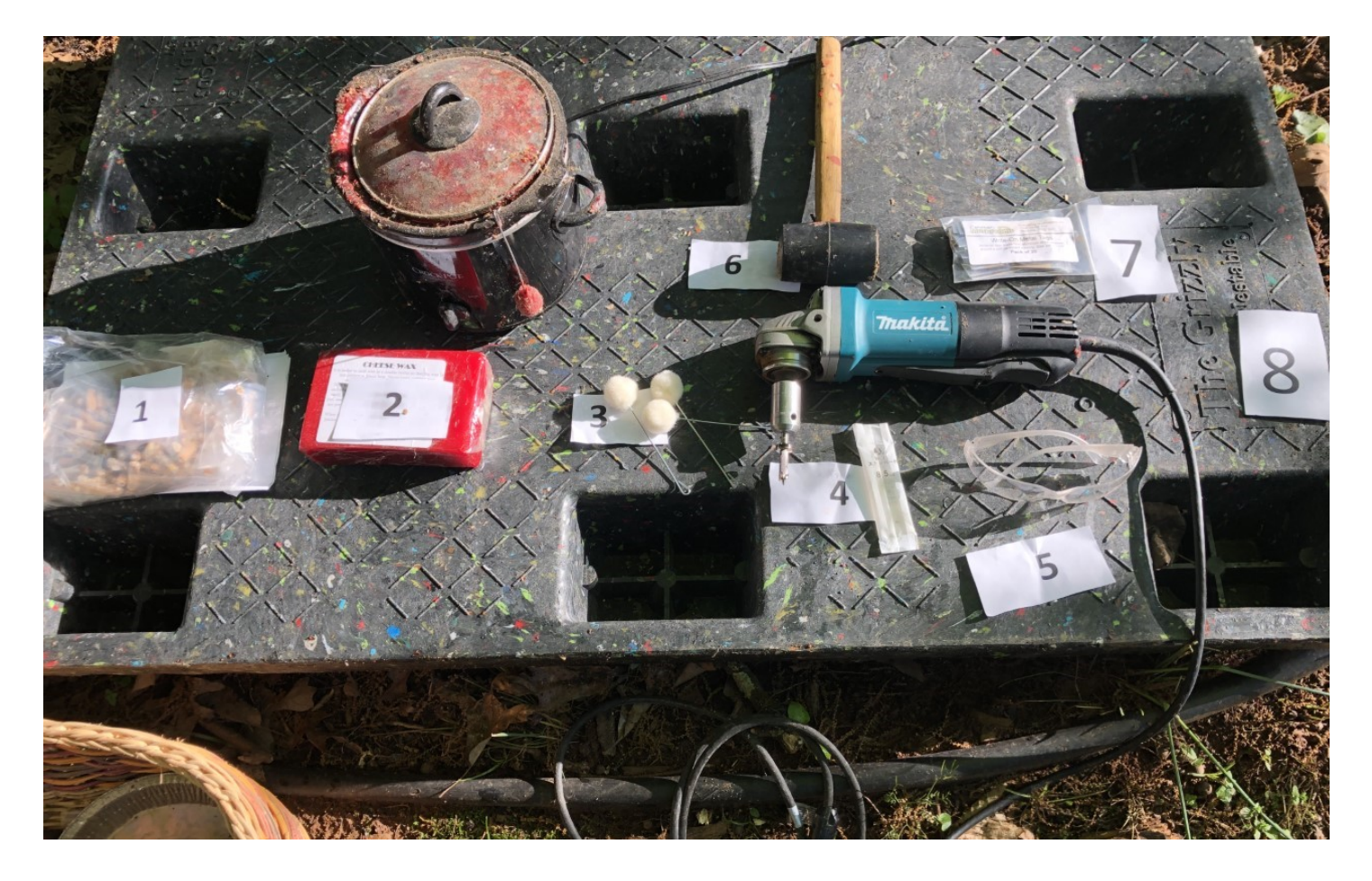
When the time came, supplies needed were put in order.