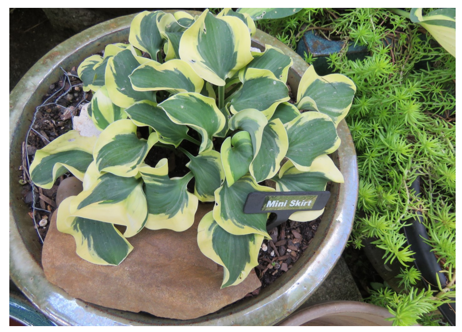
Another popular descendent of H. 'Blue Mouse Ears' is H. 'Mini Skirt'. When I bought this one, I enjoyed telling people, "Oh, I just bought a mini skirt." Then I'd watch them look astonished because they were pretty sure I wouldn't wear a mini skirt.